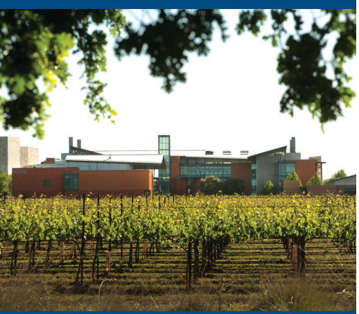
Gregory Urquiaga/ UC Dav