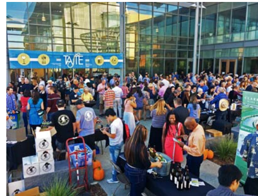
TASTE: 2016 Welcomes 400+ to the Good Life Garden